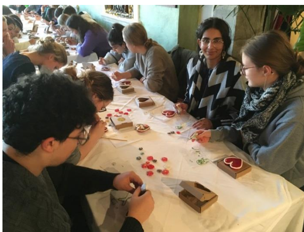
Workshop in the Gingerbread Museum

The entire project group also enjoyed a number of sightseeing activities: a treasure hunt game in Ljubljana, a visit to Planica nordic ski center, Lake Bled, Gingerbread Museum in Radovljica, Postojna Cave and Piran.