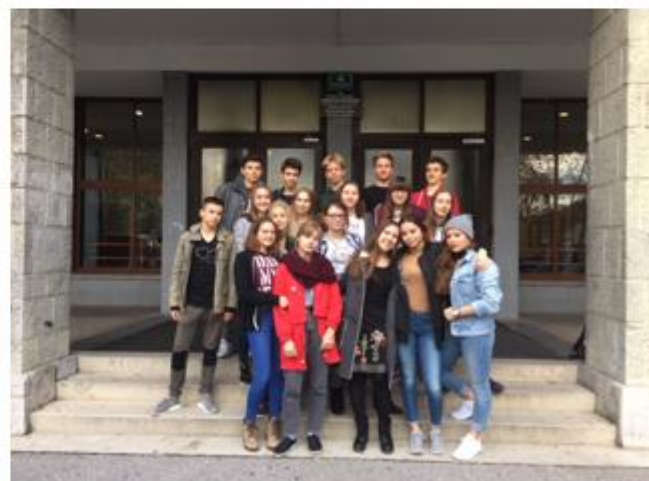
Students from all four participating schools