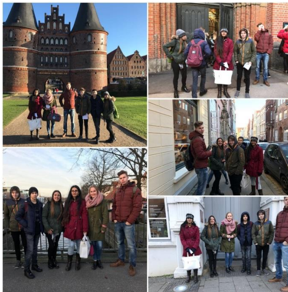
Visit to charming Lübeck

Admittedly, our stay in Kiel was not all work. We will remember the warmth and cordiality of our hosts, new friends, a freezing walk along the Kiellinie promenade, a visit to charming Lübeck and the festive spirit of Christmas markets.