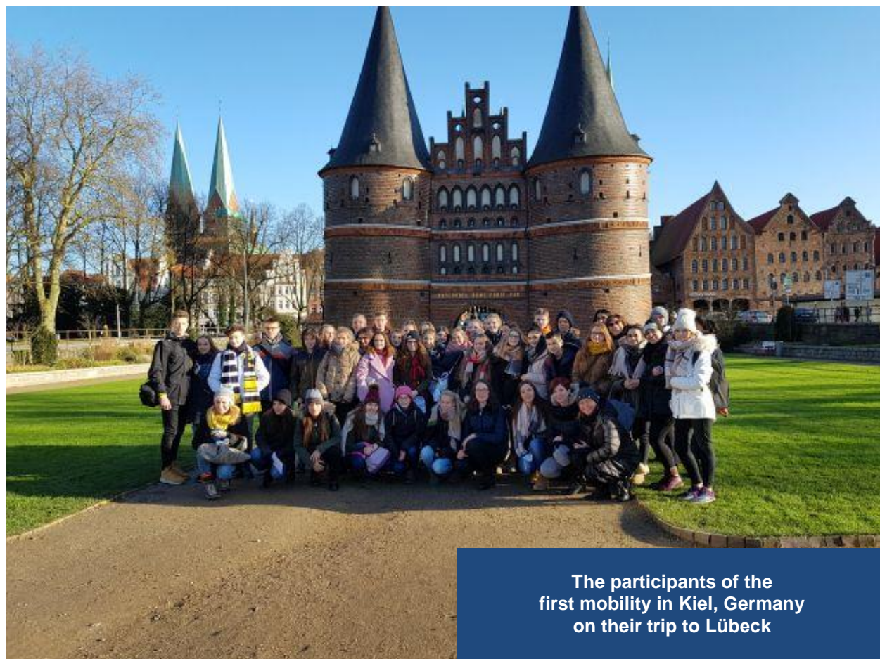
The participants of the first mobility in Kiel, Germany on their trip to Lübeck