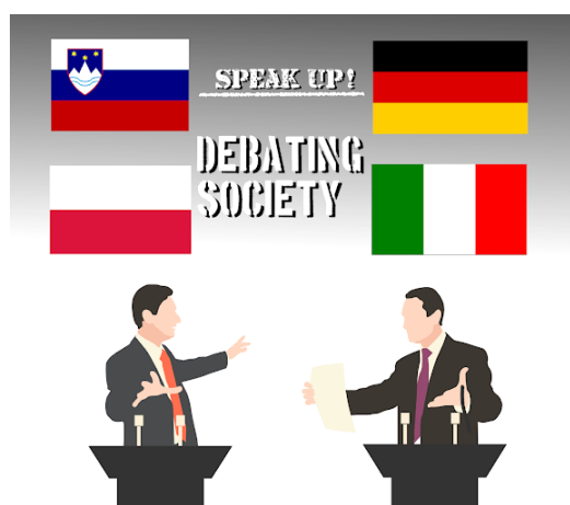
Speak up Debating Society logo

For project »Speak up Debating Society« there were 14 suggestions. Official logo (below) won with 21 votes.