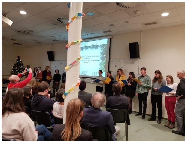
At the Western Slavic Christmas event

For the Polish group, an unforgettable experience was the Western Slavic Christmas Event hosted by the University of Ljubljana Faculty of Arts.