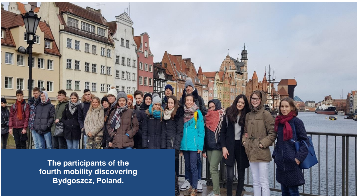
The participants of the fourth mobility discovering Bydgoszcz, Poland.

The stay in Bydgoszcz was not all about learning and public speaking though. In their free time the participants enjoyed the numerous attractions of our city.