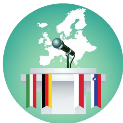
Speak up, even if your voice shakes logo

SPEAK UP EVEN IF YOUR VOICE SHAKES • SPEAK UP DEBATING SOCIETY