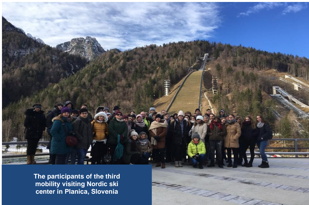
The participants of the third mobility visiting Nordic ski center in Planica, Slovenia

We would like to say a big thank you to the teachers and students of Gimnazija Bežigrad for their warm welcome and invite the whole project team to Bydgoszcz this spring.