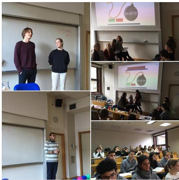
During lecture and model Oxford debate