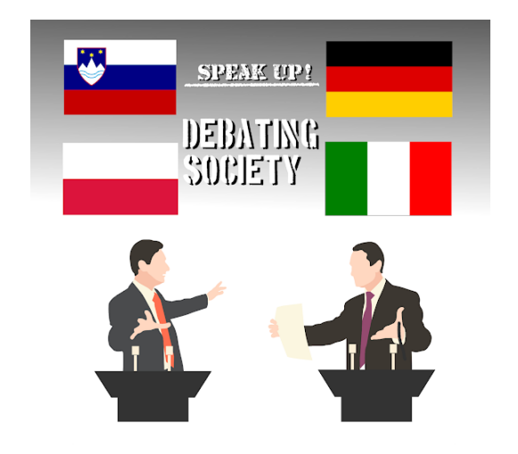
Speak up Debating Society logo

For project »Speak up Debating Society« there were 14 suggestions. Official logo (below) won with 21 votes.