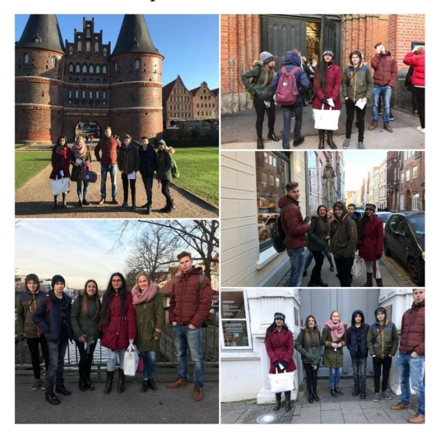
Visit to charming Lübeck

Admittedly, our stay in Kiel was not all work. We will remember the warmth and cordiality of our hosts, new friends, a freezing walk along the Kiellinie promenade, a visit to charming Lübeck and the festive spirit of Christmas markets.