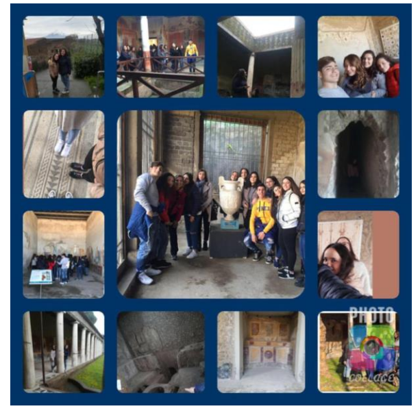
Visiting Villas Stabiae

From 16th to 24th March, six teachers and eighteen students (two teachers and six students from each country) coming from Bydgoszcz, Kiel and from Ljubljana were guided by our students to discover our cultural heritage: tangible, intangible and natural. Our students played the role of tourist guides during the visit to Pompeii ruins, Villas Stabiae and Sorrento.