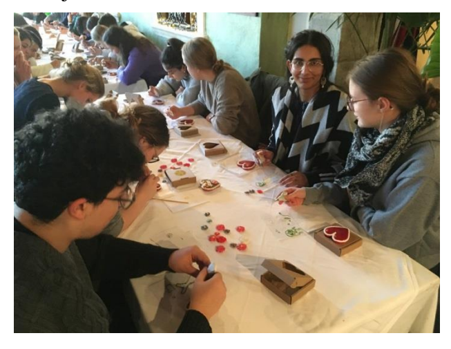
Workshop in the Gingerbread Museum

The entire project group also enjoyed a number of sightseeing activities: a treasure hunt game in Ljubljana, a visit to Planica nordic ski center, Lake Bled, Gingerbread Museum in Radovljica, Postojna Cave and Piran.