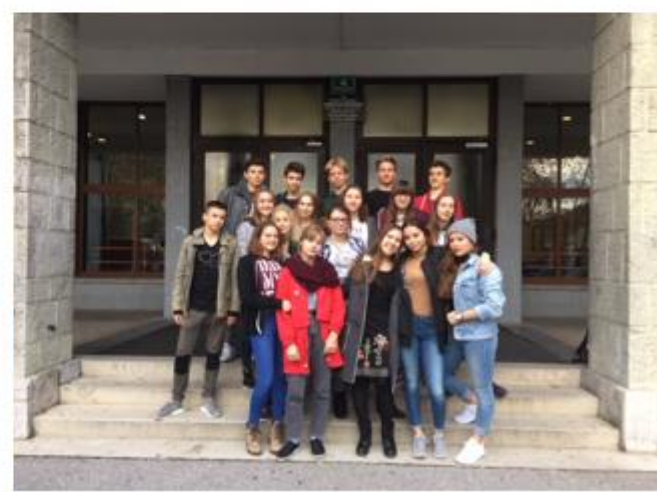
Students from all four participating schools