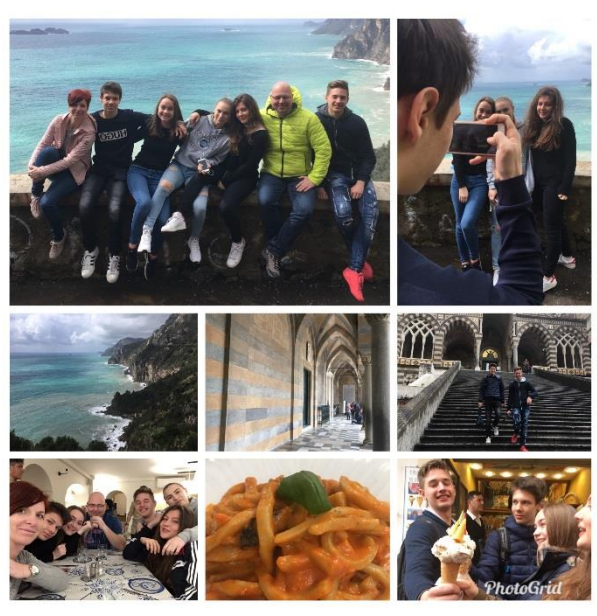
Trip along the beautiful coast to Amalfi

During the farewell evening party, on Friday 24th, in the presence of the coordinator teachers, the headmaster of our school, the host families, the representatives of the local authorities, the students presented their work to the public and performed folk dances from each country. An international buffet was organized by the students themselves in order to share and celebrate their European Citizenship.